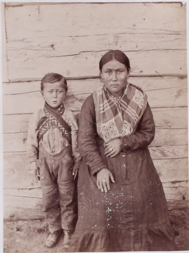
22. Esquimau woman and son, civilized.